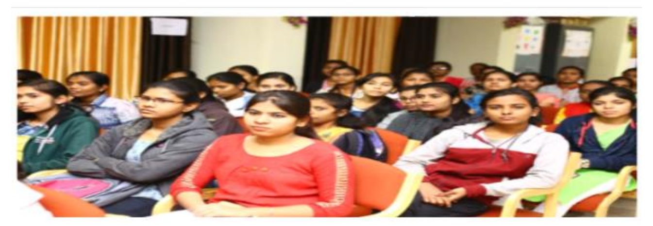
Feedback from participants